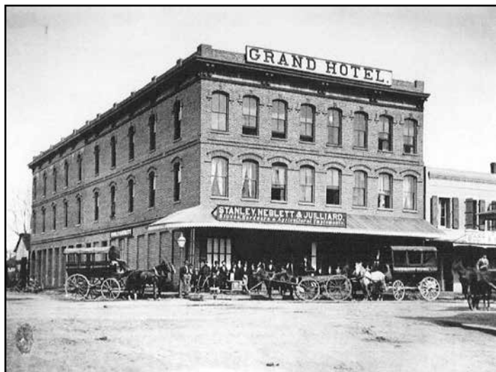
Grand Hotel at Third and Main (SR Avenue, today)

south of the plaza. Parish of St. Rose established and includes