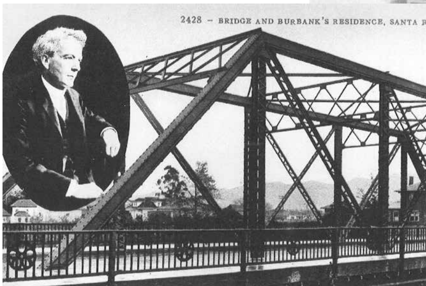
Santa Rosa Creek Bridge and Luther Burbank