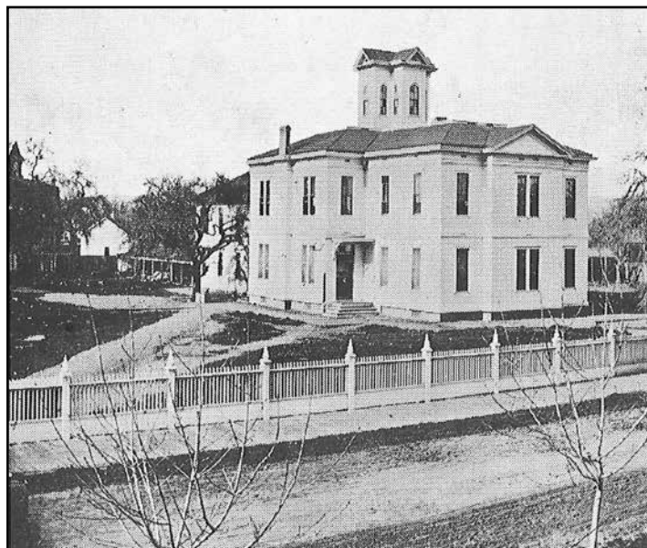
SRHS occupied upper floor Fourth Street School Santa Rosa High School Museum