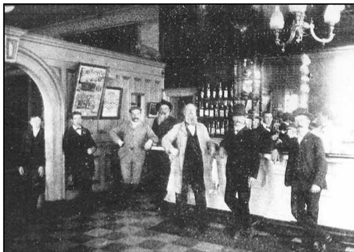
Grand Hotel Bar in 1870s

1878 Santa Rosa High School graduates first class—eight girls and two boys.