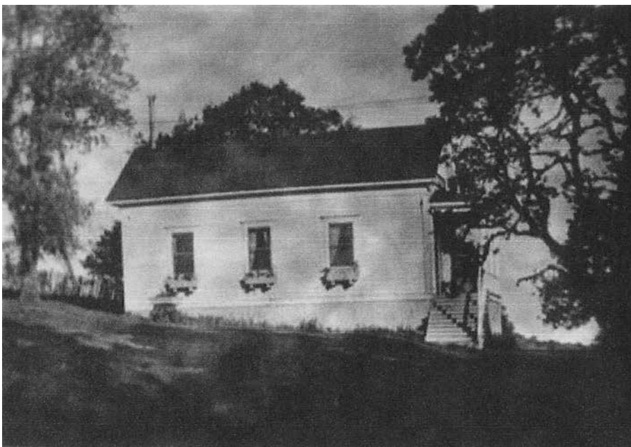
Bennett Valley School, built about 1885